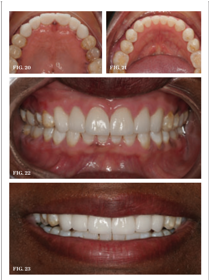
(20. THROUGH 23.) The first phase of the treatment plan is complete. Final restorations are in place on teeth Nos. 6 through 11. Maxillary posteriors and lower anterior sextant can be finalized a segment at a time.